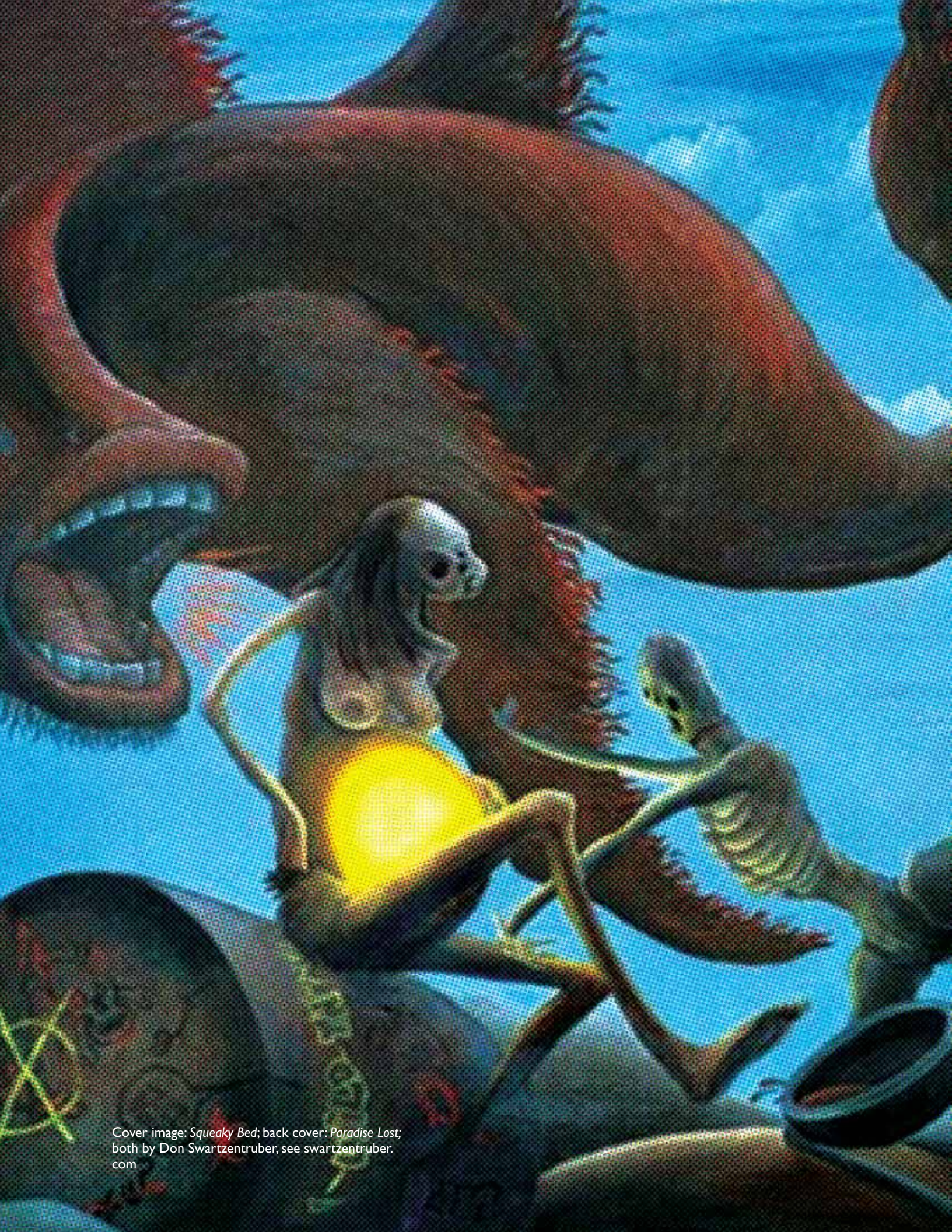
Cover image: Squeaky Bed ; back cover: Paradise Lost ; both by Don Swartzentruber; see swartzentruber.com