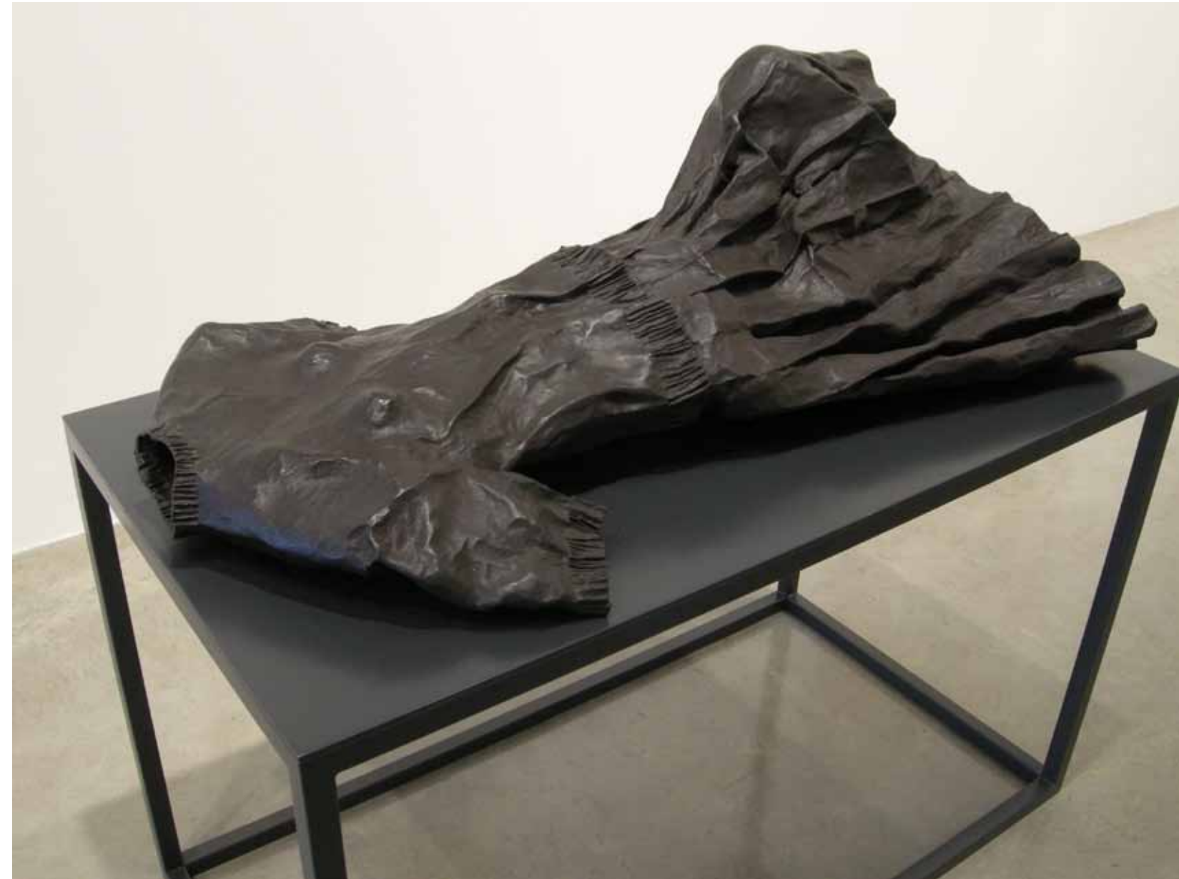
Reclining Figure (after Henry Moore) Gathie Falk Bronze 41 x 22 x 13 inches 2002

The Mennonite Literary Society 606-100 Arthur Street Winnipeg, Manitoba R3B 1H3.